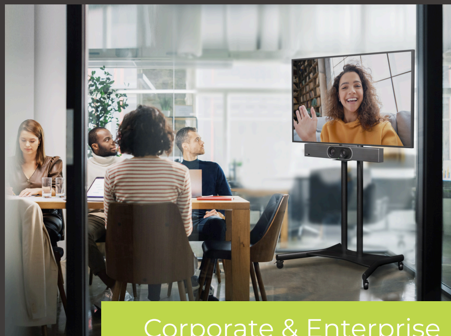
Corporate & Enterprise